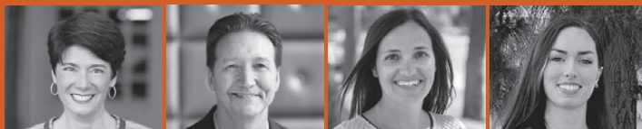
Meet our team of CFP® professionals

apellawealth.com 714.971.0663 5011 ARGOSY AVENUE, SUITE 7 • HUNTINGTON BEACH, CA 92649