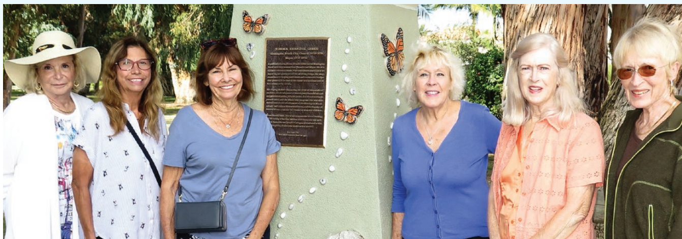
Members at Gibbs Butterfly Park.

The Sea Isle Garden Club October meeting was held at Gibbs butterfly park in Huntington Beach.