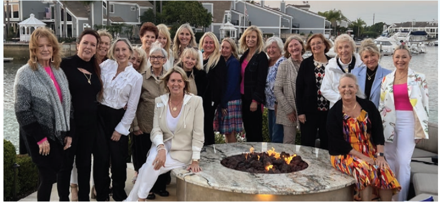
Our September meeting group.

We will continue to make this season perfect. Happy Holidays to everyone and we look forward to 2024!