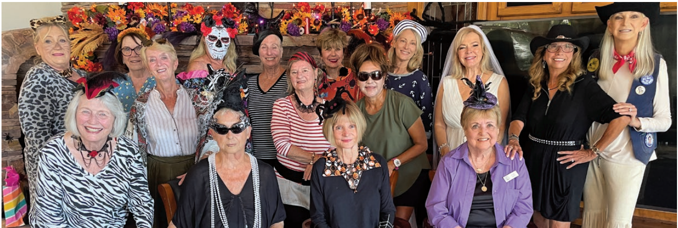
Sandpipers at October meeting.

The Sandpipers had fun working at the 16th Annual Holiday Boutique on October 6th and 7th.