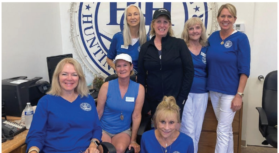
Our fabulous members at Holiday Boutique.