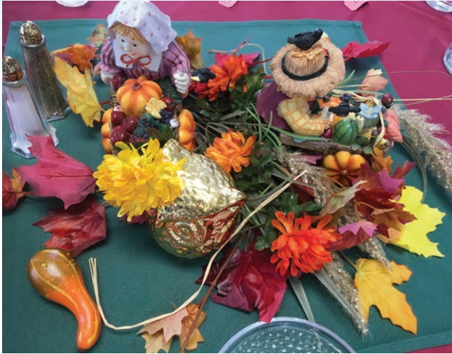
"My dear Hubby, a crow is sitting on your head!"